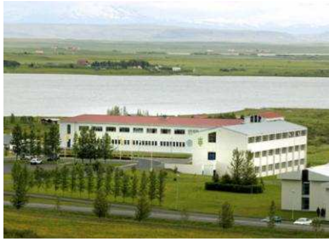
Edda ML Laugarvatn Hotel

THE REGISTRATION DEADLINE IS NOW : MARCH 1, 2010.